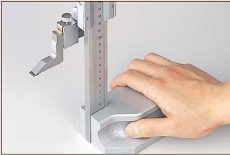
Base fits the hand comfortably.