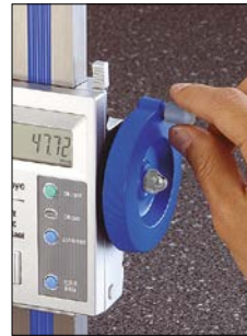
Slider height adjustment wheel.