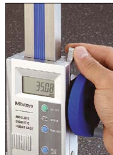
Large clamp lever.