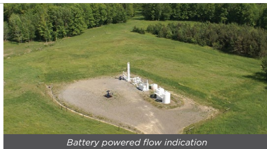
Battery powered flow indication