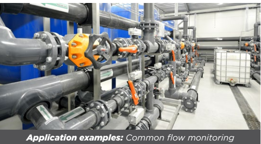
Application examples: Common flow monitoring