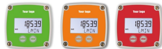
Your brand customization

The basic indicators of the B-Series have all the benefits you may expect from a Fluidwell product: It's durable, reliable and very easy to operate. For more advanced functionality we recommend our D-, E-, F- and N-Series.