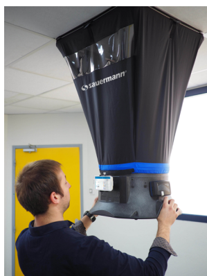
Use of the air flow meter