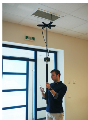
Use with the measurement grid