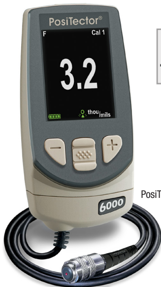
PosiTector 6000 FNS1