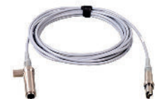
SC 91A Microphone Extension Cable